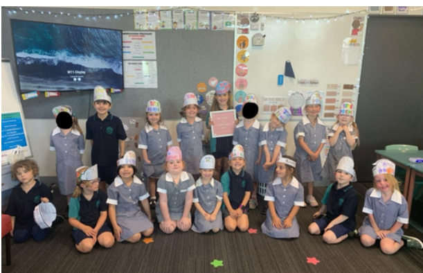
Our wonderful Prep/1 class on their first day

We are very fortunate to have Ainsley with on Tuesdays and Wednesdays.